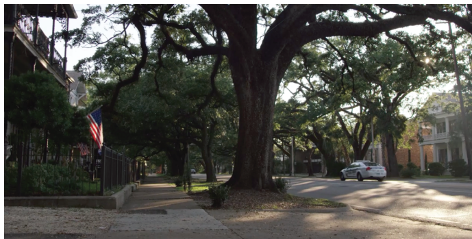
Help make Mobile the safest city in America with respect for everyone.

Project Shield is the gateway between the valuable assets possessed by virtual crime deterrence, local business surveillance systems, and even camera systems sponsored by nearby homeowners' associations. Project Shield is more than just camera system access, it's about partnership.